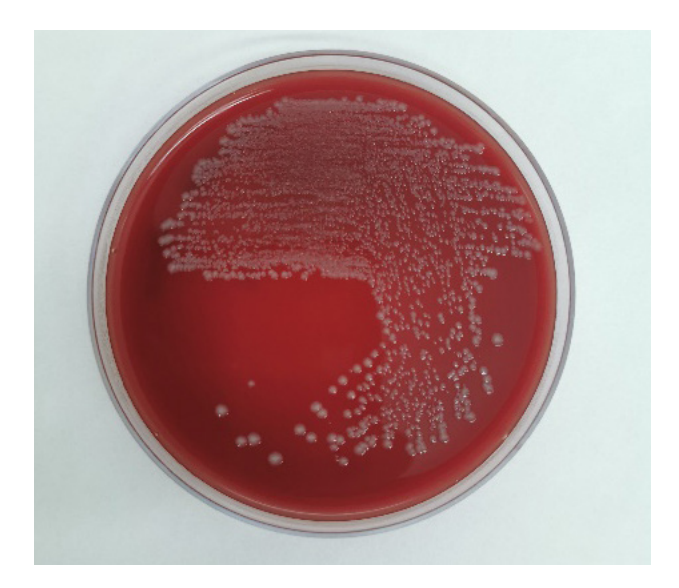
Figure 1: Isolate on BAP