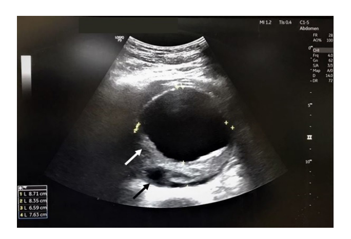
Figure 1: Point-of-care ultrasound (POCUS) in transverse view shows abdominal aortic aneurysm (AAA) measuring 8.7 cm x 8.3 cm with eccentric mural thrombus (white arrow), and para-aortic anechoic area (black arrow) with posterior enhancement suggestive of para-aortic haematoma

Electrocardiogram showed a sinus tachycardia with heart rate of 100 bpm with no ischaemic changes. Chest radiograph showed no widened mediastinum. An abdominal ultrasound which was performed by a medical officer in the ED revealed an AAA measuring 8.7 cm x 8.3 cm with eccentric mural thrombosis and para-aortic haematoma (Figure 1). Following POCUS revelation of AAA, immediate surgical referral was made. As patient was stable, the surgical team decided on contrast-enhanced computed tomography (CECT) for further surgical assessment and plan.