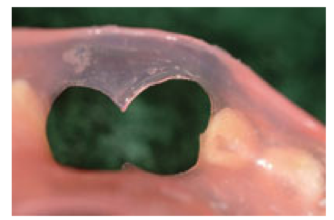
Figure 5: The continuous circumferential clasp

iii. The continuous circumferential clasp It is a circumferential clasp which surrounds and engages multiple teeth and may provide splinting like action (Figure 5) (38).