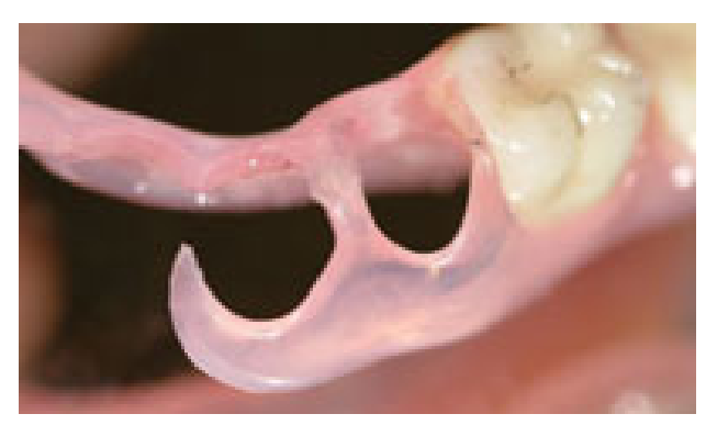
Figure 6: The combination clasp

This clasp is engages multiple teeth in combined form of both the main clasp and the continuous clasp. The connection between both clasps will cross the occlusal table and provide rest like action (Figure 6) (38).