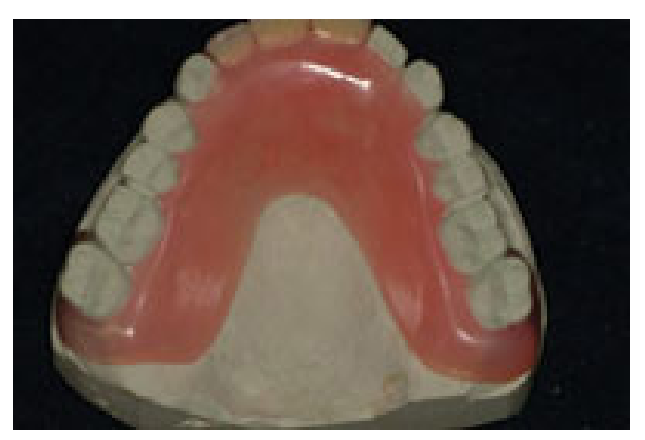
Figure 7: Reach around clasp

Mostly designed for Kennedy class IV and it engages the last molar by engaging the mesiobuccal undercut area. This design is contraindicated and should be avoided, as it is too thick and very bulky (Figure 7) (38).