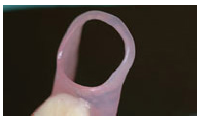
Figure 4: The circumferential clasp

iii. The continuous circumferential clasp It is a circumferential clasp which surrounds and engages multiple teeth and may provide splinting like action (Figure 5) (38).