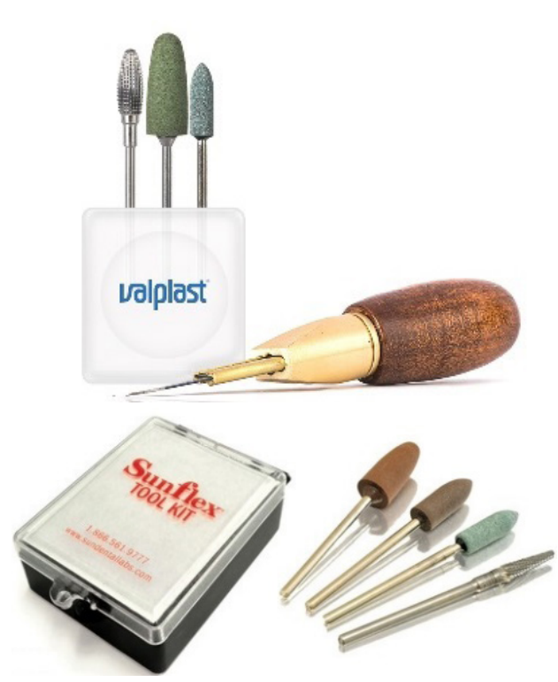
Figure 2: Polishing kits for the flexible denture prostheses