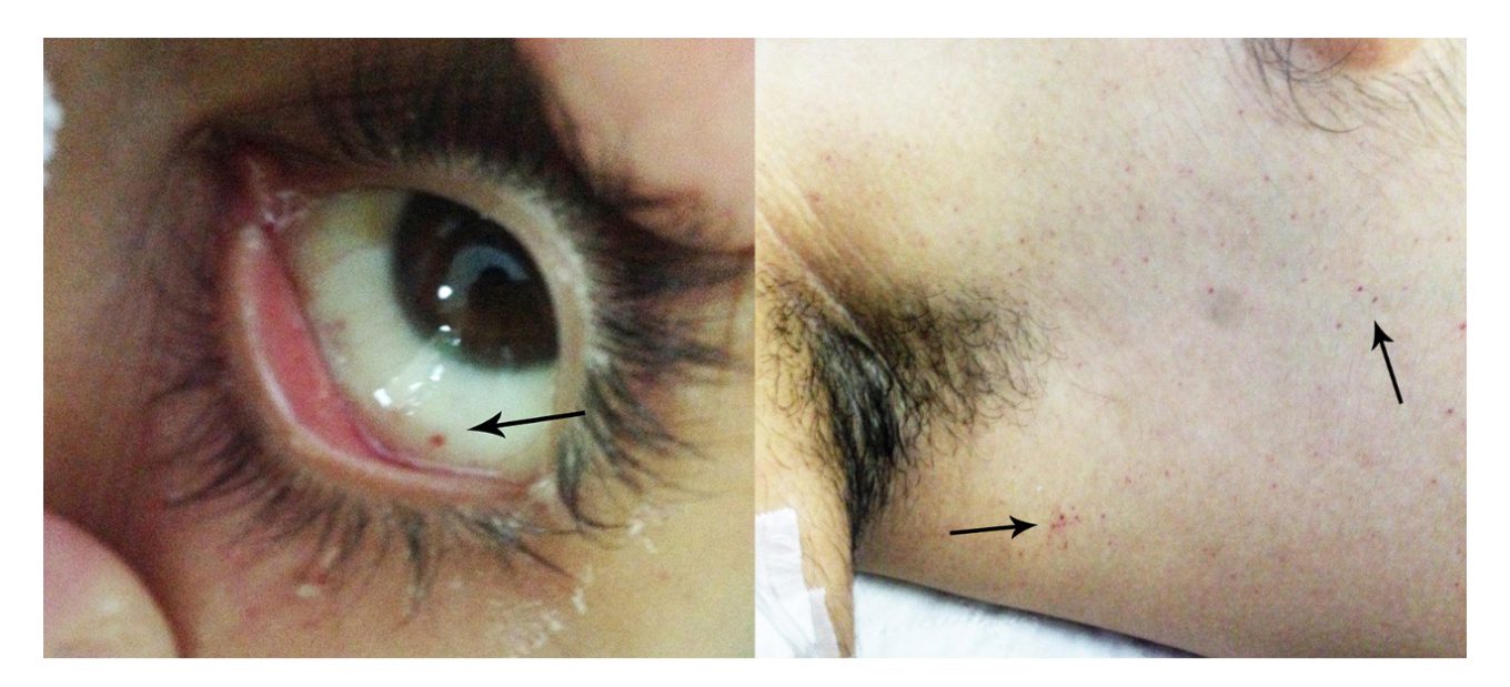
Figure 1: Images showing axillary, truncal and subconjunctival petechiae

A computed tomography pulmonary angiogram was performed to rule out pulmonary thromboembolism. The results revealed a filling defect within the secondary branches of the left descending, right upper lobe pulmonary artery and tertiary branches of descending right pulmonary artery, which indicated the presence of a thrombus (Figure 2). The patient was started on anticoagulation therapy, comprising of subcutaneous enoxaparin 60 mg twice daily.