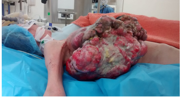
Figure 1a and 1b: Lateral and anterior views of the large fungating right breast tumour