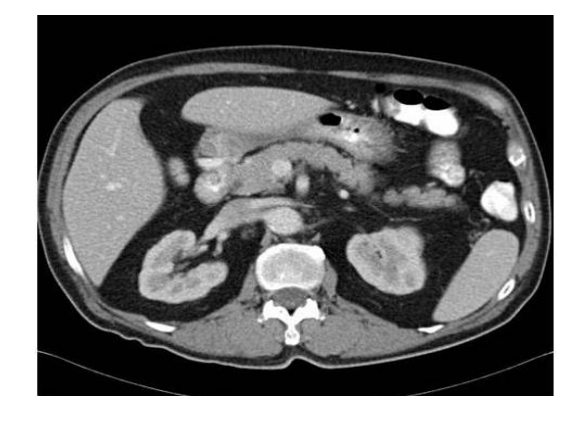
Figure 1 . Abdominal CT image of the tumour in the left adrenal gland

description of a pigmented 'black' adrenal adenoma is a rare variant of this condition. It is often associated with hypercortisolism and is very rarely due to hyperaldosteronism. Due to its rare incidence, only