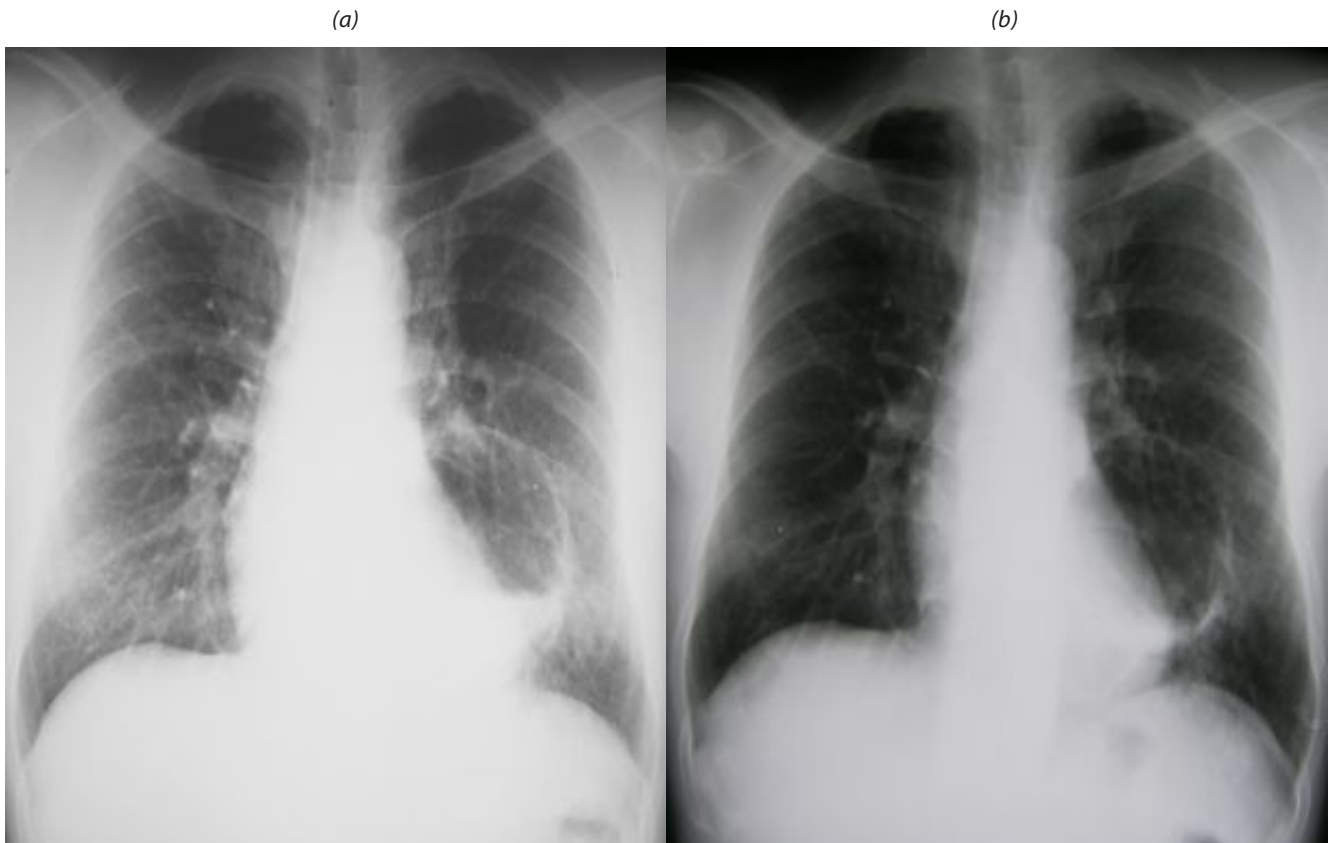
Figure 1: (a) and (b) Bronchogenic cyst. (a) Chest radiograph demonstrate a thin-walled cyst in the left lower lobe with an air-fluid level and surrounding pneumonic changes.

(b) Post-antibiotics. There was no significant change of the lesion except for the slightly decreased air-fluid level and pneumonic changes surrounding the cyst.