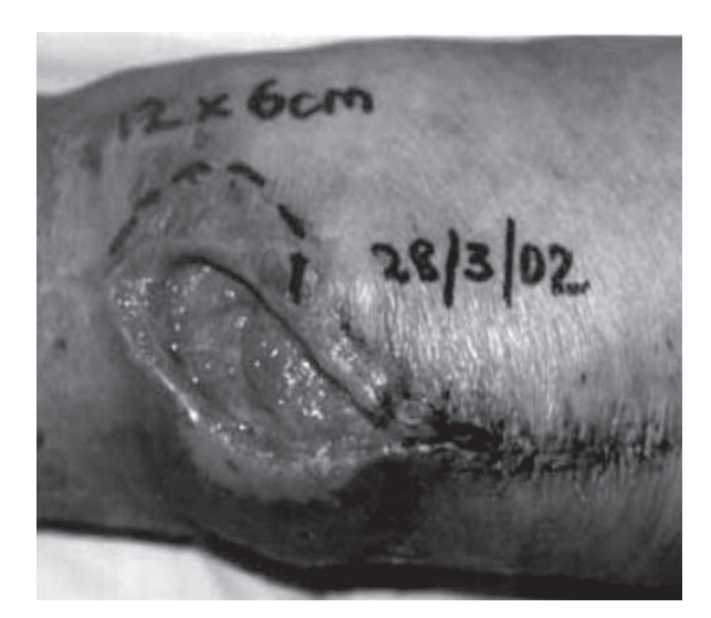
Figure 5. Wound dehiscence following total knee replacement