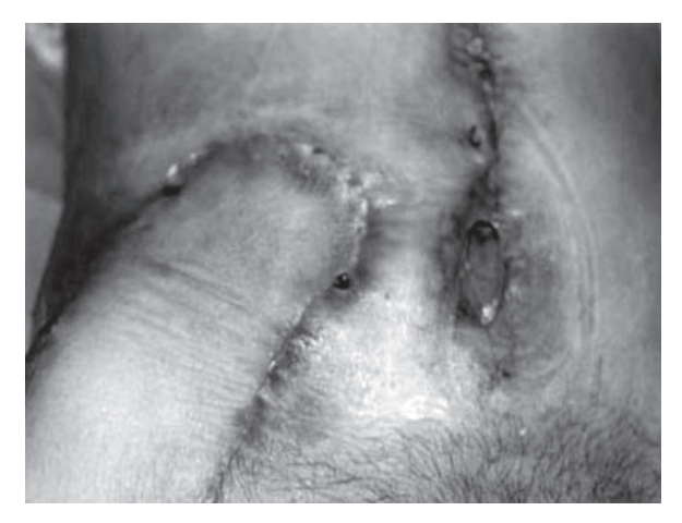
Figure 3. Dehiscence of the midline laparotomy wound