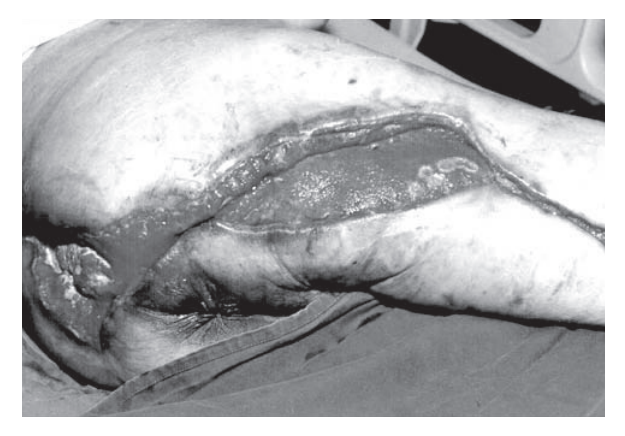
Figure 9. The wound at one month just prior to split skin graft

six months previously. The extensive necrotic area on the posterior aspect of the right thigh and gluteal region was debrided twice and daily dressing of the wound with modified vacuum-assisted suction was done (Figures 7 and 8).