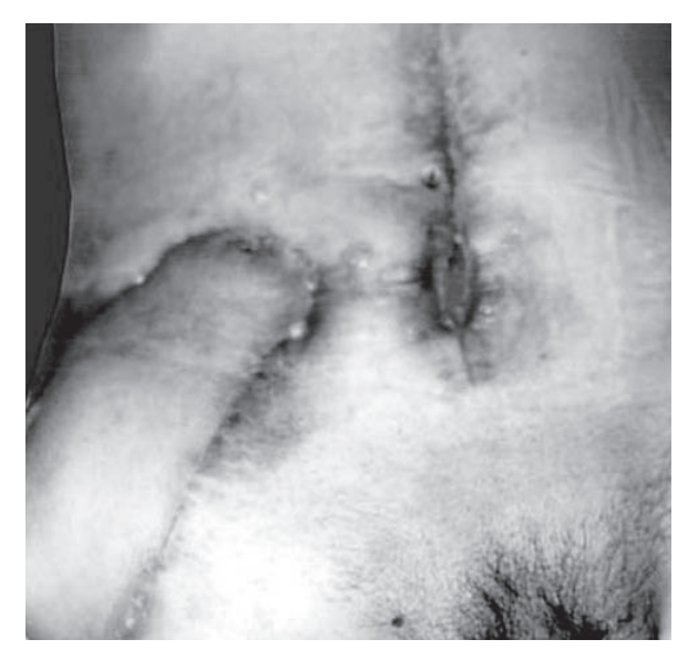
Figure 4. Wound almost closed following vacuum-assisted suction dressing

with iodine-soaked gauzes. An occlusive dressing (Opsite, Smith & Nephew, Hull, UK) was placed over the defect to achieve airtight closure, with the edges of the dressing extending 3-5 cm over the adjacent intact skin, converting the open wound into a controlled closed wound. The drainage catheter was connected to a wall suction vacuum unit continuously to maintain a tightly collapsed state and crinkled appearance of the occlusive dressing. The vacuum pressure was maintained at 150mmHg (-200mBar). The wound was inspected and the dressing changed daily. Analgesia in the form of pethidine injection was given prior to each dressing change. The management of the patient's wound in this manner did not hinder her mobility, as she was instructed to disconnect the tubing from the wall unit if she wished to mobilize or use the toilet or shower. The tubing was simply plugged with a stopper during mobilization.