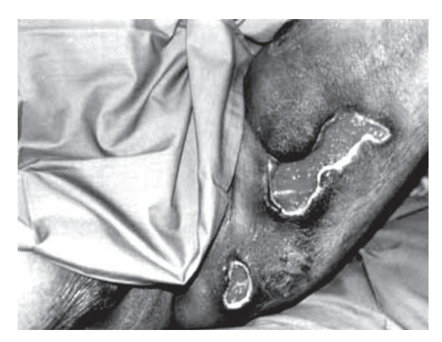
Figure 2. Diabetic ulcer over the left thigh following application of vacuum-assisted closure dressing