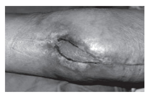
Figure 6. The wound following application of split skin graft