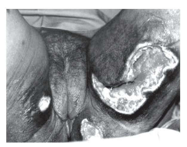
Figure 1. Diabetic ulcer over the left thigh following debridement

diameter (Figure 1). Following irrigation of the wound, a 14F-size nasogastric tube was placed in the depths of the wound. The proximal end was then bought out at the edge of the cavity. The cavity was loosely packed