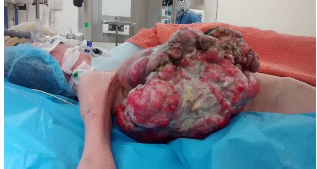
Figure 1a and 1b: Lateral and anterior views of the large fungating right breast tumour