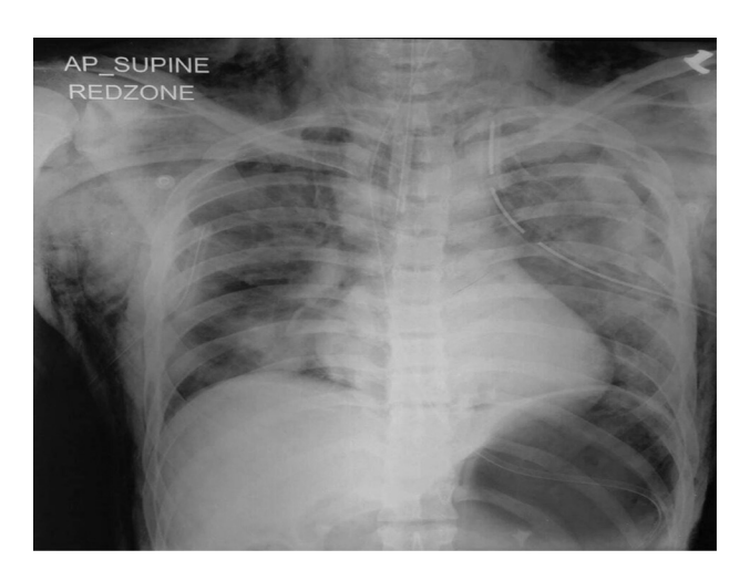
Figure 1: Chest X-ray shows bilateral pneumothorax with bilateral thoracostomy tubes in situ and 3<sup>rd</sup> to 6<sup>th</sup> left ribs fracture with massive subcutaneous emphysema

showed bilateral pneumothorax with fractures of the 3<sup>rd</sup> to 6<sup>th</sup> left ribs and massive subcutaneous emphysema (Figure 1).