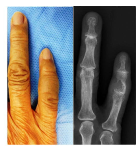
Figure 2: Clinical photo and radiograph anteroposterior view of Patient 2

Radiographs showed similar findings of an expansile lytic lesion over the middle phalanx with cortical breach preserving the joint (Figure 1, 2). Osteomyelitis was initially suspected but in the absence of previous bony injury, a biopsy was performed to confirm the diagnosis. Bone biopsy was performed for both patients with similar technique. An incision (1 cm) was made over mid-dorsum of the middle phalanx and a core needle biopsy sample was taken distal to the central slip insertion. However, the results were not the same. Patient 1 was diagnosed with intraosseous gout (Figure 1) and patient 2 with epithelioid hemangioma (Figure 2, 3).