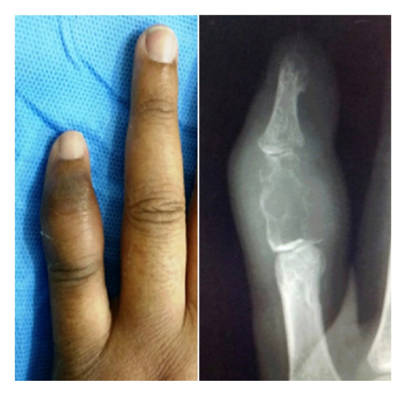
Figure 1: Clinical photo and radiograph anteroposterior view of Patient 1

10° fixed flexion deformity with 70° flexion limited by swelling.