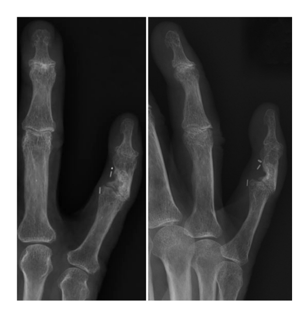
Figure 5: Post-operative 18-months radiographs showing more than 50% of consolidation

Six month post-surgery, she regained her grip strength (MRC 4+). Range of motion at PIPJ was 10° to 70°; similar to pre-operative findings. Radiographs at 18 months follow up showed consolidation of more than 50% of the intraosseous lesion (Figure 5). There was no evidence of infection, recurrence or malignant transformation at two years follow-up.