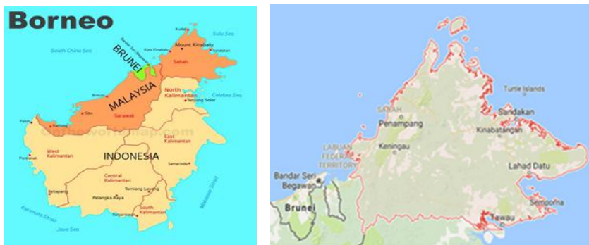
Maps 1 & 2: Borneo Map (Source: "On the World Map" [n.d.]) and Sabah Map and locations of the District Headquarters in Penampang (Source: "Discover Sabah" [2018].)