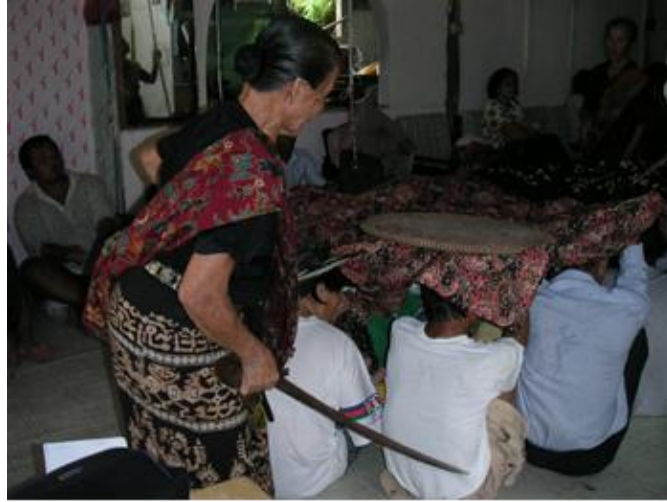
Figure 3: Performing sumazau in magampa as part of the healing process in the monogit

The pamanta offerings are also made following a process and sequences, while the bobohizan accompanied by the sompogogungan dance the sumazau in a unique manner including dancing around a group of family members sitting under blankets who suffer from bad dreams, migraine and other minor illnesses ( magampa ) (Figure 3), dancing with palm fronts and swords during feast presentation for the spirits ( mundang ), inviting the miontong to dance and serving of the dishes ( pasasazau do miontong ), sending back some of the spirits ( hoputan ), and grouping the spirits that are left ( monoinig ).