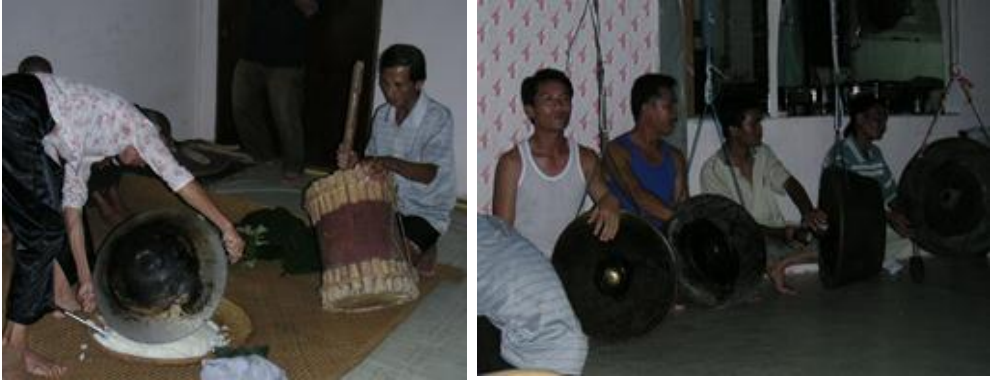
Figure 1 (left) Drum@gandang in the monogit ritual and Figure 2 (right), the sompogogungan ensemble accompanying the whole process of monogit ritual

The gandang beating and the composite sound of the gongs in the sompogogungan in the ritual context are believed to connect man with the spiritual world. The gandang beating is periodically done by a bobohizan at various stages in the ceremony while reciting an inait . The sound of the gandang and the sompogogungan is believed to assist the bobohizan in entering the spiritual world to meet, stir, and awaken the evil spirits to ask them to return the trapped human spirits.