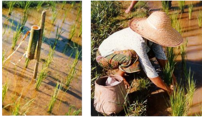
Figure 4 (left) Rice farm and Figure 5 (right) performing the sacred pa'atod hangod sending an offering to the guardian spirits of the rice field

The third day is called kinapangasan (the climax of the series) which begins with another modsuut trance session, to meet with the spirits in the spiritual world in the early morning to send back the offerings and spirits, and to bring home any last remaining stolen household spirits and rice spirits. No drumming, gong music or dancing is performed. Later in the late morning, another pig is sacrificed. The whole monogit traditionally ends on the next day (the fourth day) in the fourth phase or Pa'atod Hangod , an appeal to the dudui or guardian spirits in the paddy field with offerings and requests to safeguard the rice field (Figures 4 & 5).