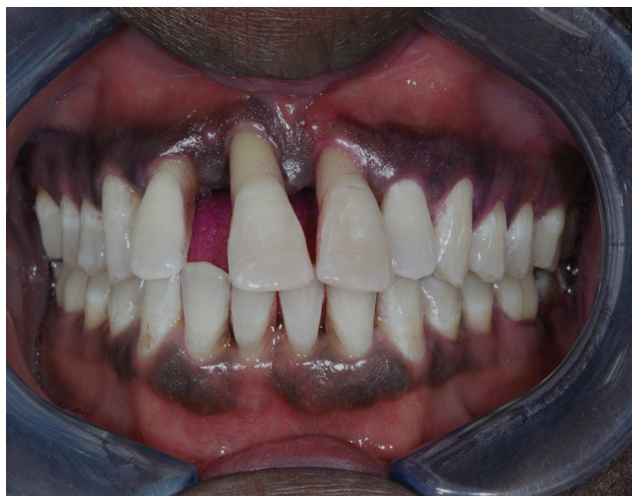
Figure 2: After Periodontal Treatment. Unsightly Gaps in Between the Upper Anterior Teeth.