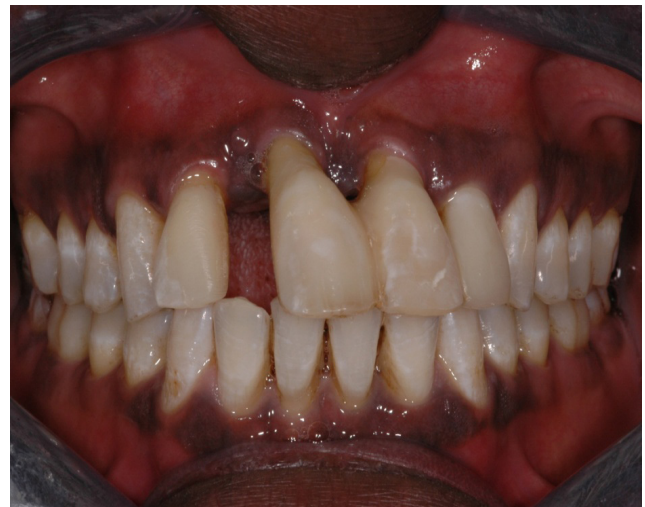
Figure 3: After Resin Composite Build Ups on Tooth 11, 21 and 22 and Splinted (11-21).