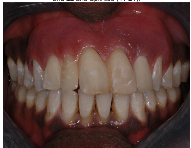
Figure 4: After Insertion of the Upper Gingival Veneer with Tooth 12 Incorporated

The objectives of treatment are to address patient’s complaints by stabilizing and maintaining the